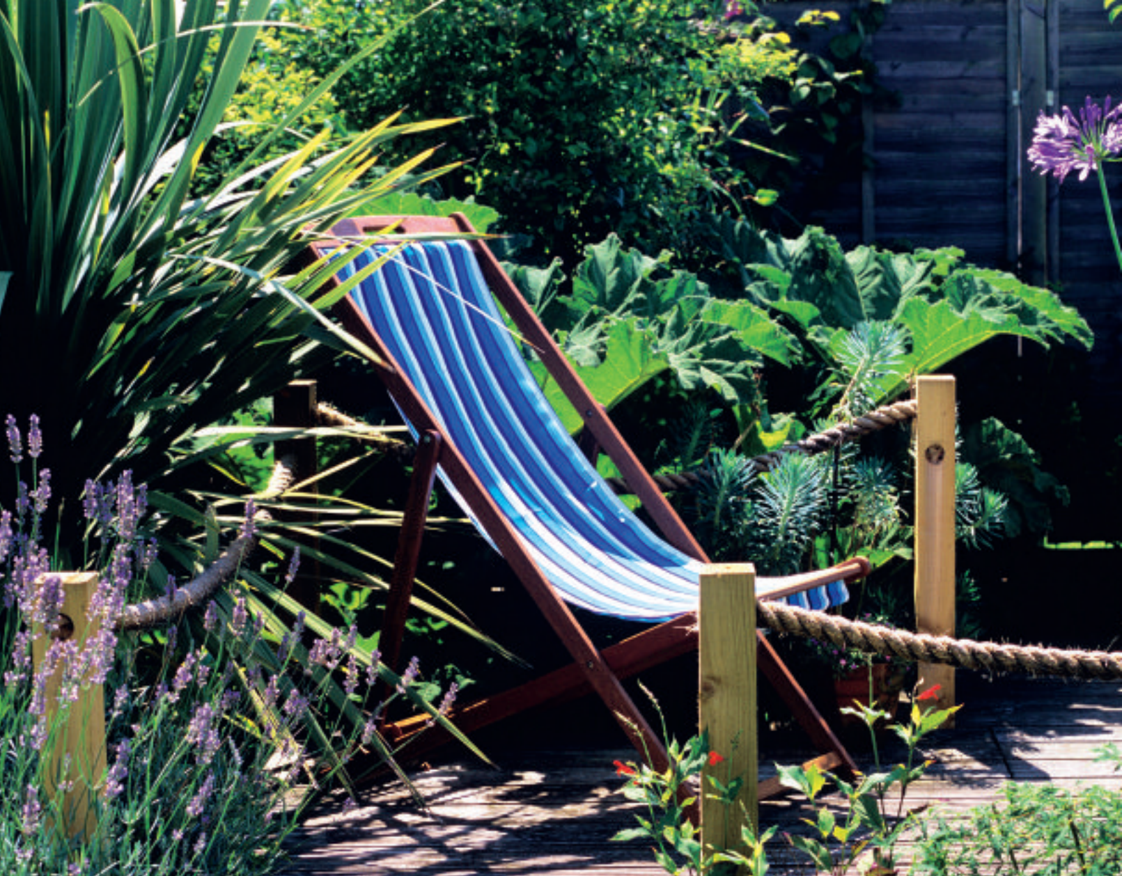
Above: Tracy added a beach-inspired area as a fun place to sit surrounded by the sunny planting. Below: Massed daisies

neglected and by the time we moved in it was full of nettles, brambles and a number of very large conifers, which we had to clear before we started. We also had to modernise the house, which meant we lived on a building site for a good many months. I preferred having to start the garden from scratch again, having a ready-made garden would not have been enough of a challenge,” Tracy remembers.